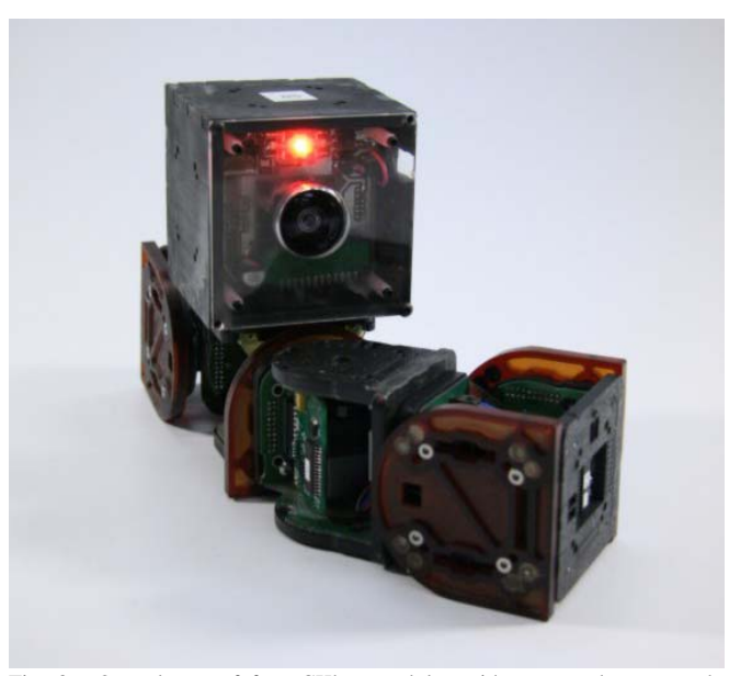
Fig. 3: One cluster of four CKbot modules with camera, battery pack, controller, and magnetic face attachments.

Figure 2 shows the layout of the seven IR pairs. Note that when two faces are attached together, the transmitter LED (TX) faces directly on to the receiver photodiode (RX) on the opposing face and vice versa. Currently, about 60 CKbot modules have been constructed and a variety of tasks have been demonstrated including moving like a snake, dynamic rolling [20], digging in sand and walking like a slinky toy see [21] for videos.