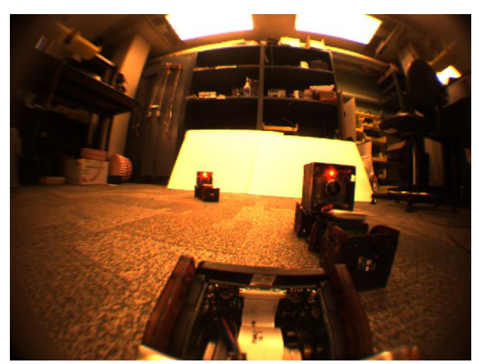
Fig 4: A view of the two other legs from the torso camera module. The wide angle fish-eye lens covers almost 240 degree.

Gait control tables are an easy way to control a large number of modules [2, 23]. The table elements contain the joint angles for each module, each column corresponds to a module and each row corresponds to a point in time. Motion from one step in the table to the next is linearly interpolated in joint space.