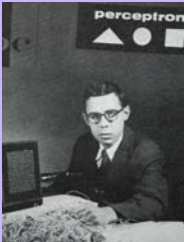
Frank Rosenblatt 1928–1969

Rosenblatt's perceptron played an important role in the history of machine learning. Initially, Rosenblatt simulated the perceptron on an IBM 704 computer at Cornell in 1957, but by the early 1960s he had built special-purpose hardware that provided a direct, parallel implementation of perceptron learning. Many of his ideas were encapsulated in "Principles of Neurodynamics: Perceptrons and the Theory of Brain Mechanisms" published in 1962. Rosenblatt's work was criticized by Marvin Minsky, whose objections were published in the book "Perceptrons", co-authored with