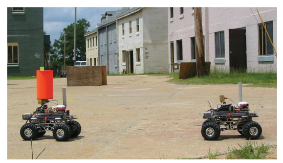
Fig. 3. Two Clodbusters in a Leader-Follower formation. The robot on the left is tele-operated while the robot on the right is executing the blob follower behavior.

Another module written specifically for this task, this component implements the original desired behavior. We implemented a distributed leader-follower controller that tries to keep the follower within a desired distance (both in x and y) from the leader, as shown in Fig. 3. The controller generates linear and angular velocities for the follower based on its distance and bearing to the leader. Thus, this module can accurately be viewed as converting stereo blob localizations into robot motion commands. At this point in the design hierarchy, both input and output types are completely independent of target platform or usage scenario, thus leaving the component's functionality completely portable.