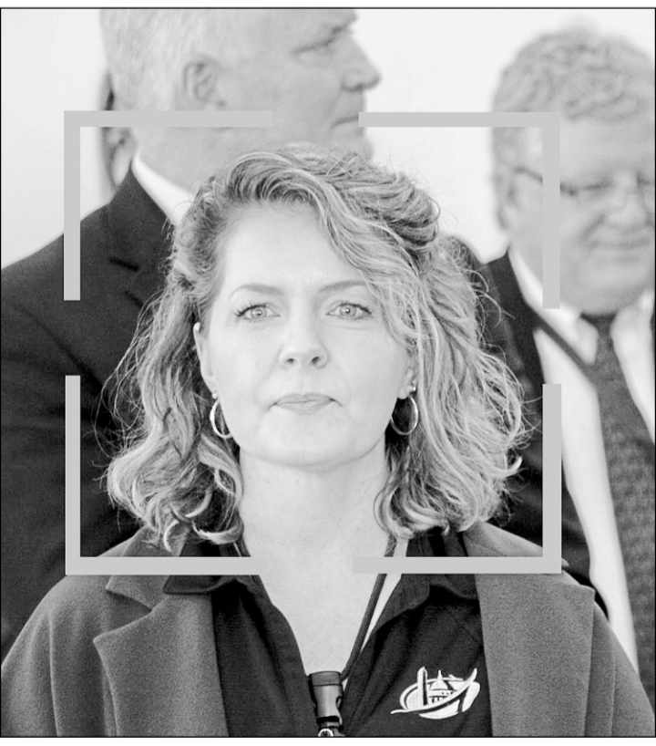
As passengers board, a tablet device scans their face and compares the image to passport or visa photos in a database. If there is a mismatch, additional screening might be conducted.