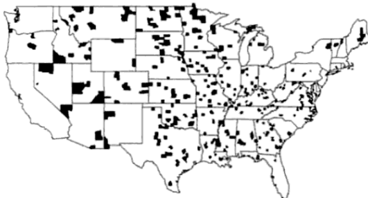
Fig. 2.3 The counties of the United States with the highest 10% age-standardized death rates for cancer of kidney/ureter for U.S. white males, 1980–1989. Hand this map out to the students and ask why most of the shaded counties are in the center-west of the country. See Section 2.2 for discussion.