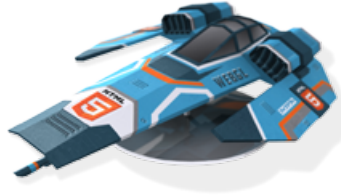
Figure 1: Hexmki, HexGL's main model